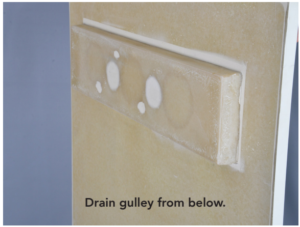
Linear shower base showing four gradients and three outlet locations in drain gulley.