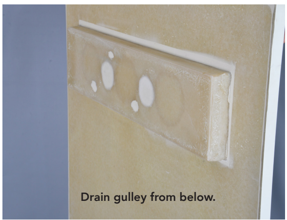
Linear shower base showing four gradients and three outlet locations in drain gulley.